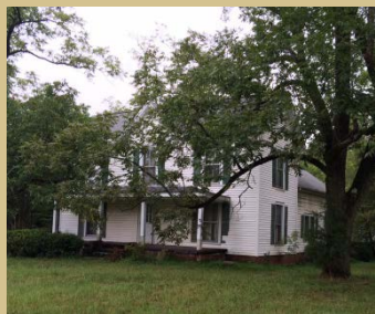
One of 3 Houses